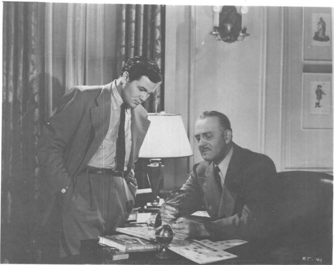
Moroni Olsen and John Garfield in "Dangerously We Live."